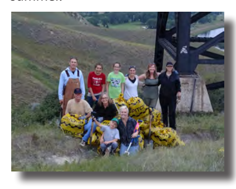
Knapweed Pull 2013

The OWC appreciates all the weed control efforts going on in our basin! Thanks to the many activities undertaken from dedicated groups and individuals we all enjoy the benefits of a healthier, cleaner watershed! The following are just a few of the weed pulls that the OWC managed to partake in this summer.