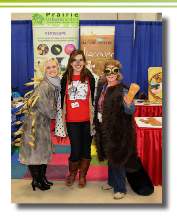
Children's Festival with partner Helen Schuler Nature Centre