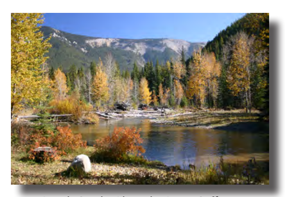
Dutch Creek