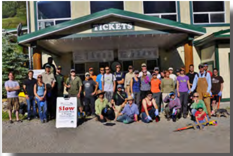
Castle Wetland Weed Pull 2013

The Pincher Creek Watershed Group held their annual "Blueweed Blitz" with over 80 volunteers taking part filling nearly 200 bags! This year marked the group's 11th weed pull year!