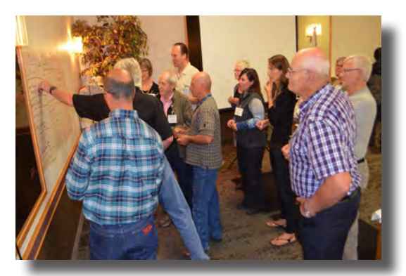
PAN - selecting indicators - June 24, 2013